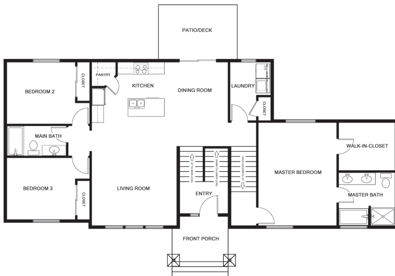
Main/Upper Level 1585 SQ FT