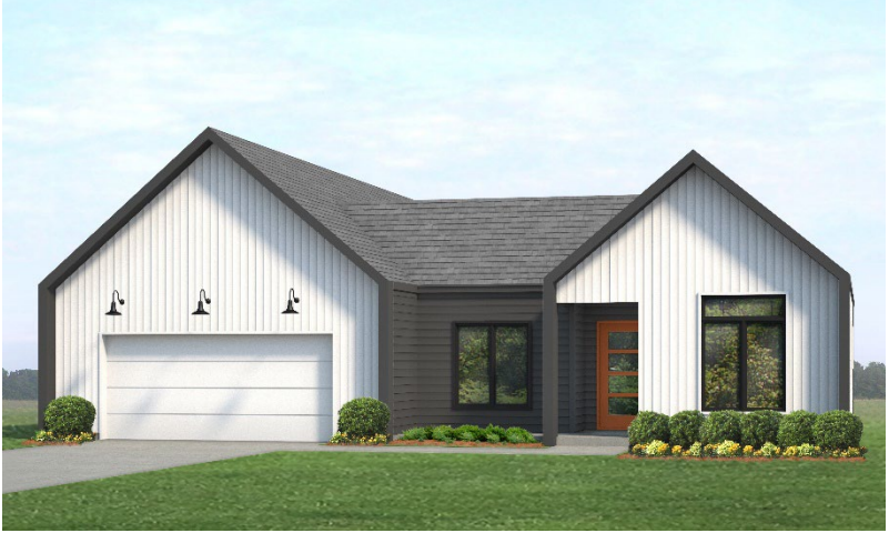
Original. Modern. Distinct.