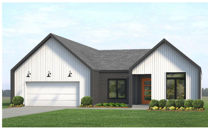
Original. Modern. Distinct.