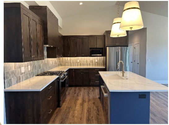
Delta Nicoli Champagne Bronze

Shaker Cabinets: Island/Laundry: Navel Perimeter/Baths: Chestnut stain on Alder Pulls: Destine 5" Pull by Amerock* Edona Cabinet Knob in Champagne Bronze